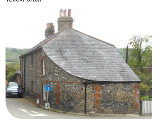
Flint and brick