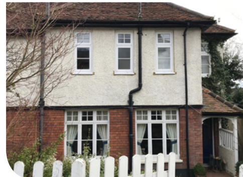
Roughcast and red brick