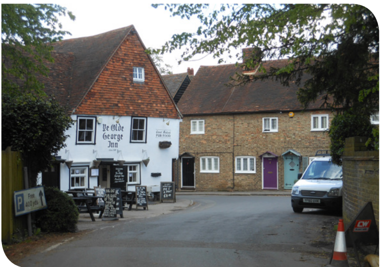
Contrasting areas of looser and denser texture