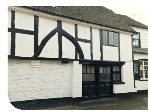
Rubble stone and timber frame