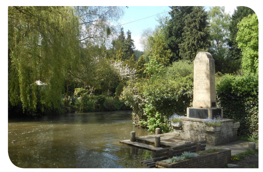
Obscured view from the war memorial