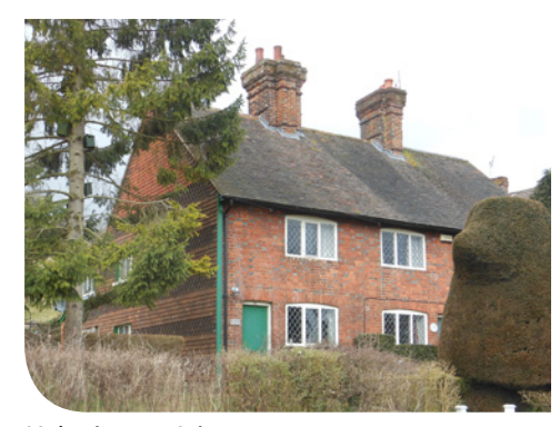
Unbroken roof slopes