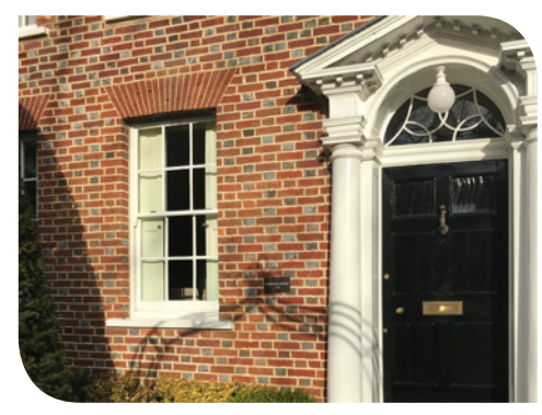
Flemish bond brickwork