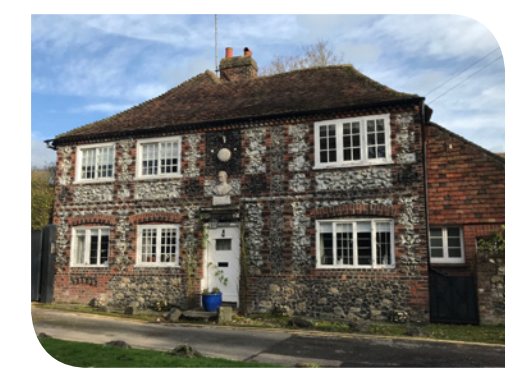
Brick and flint

Shoreham Conservation Area Appraisal July 2019