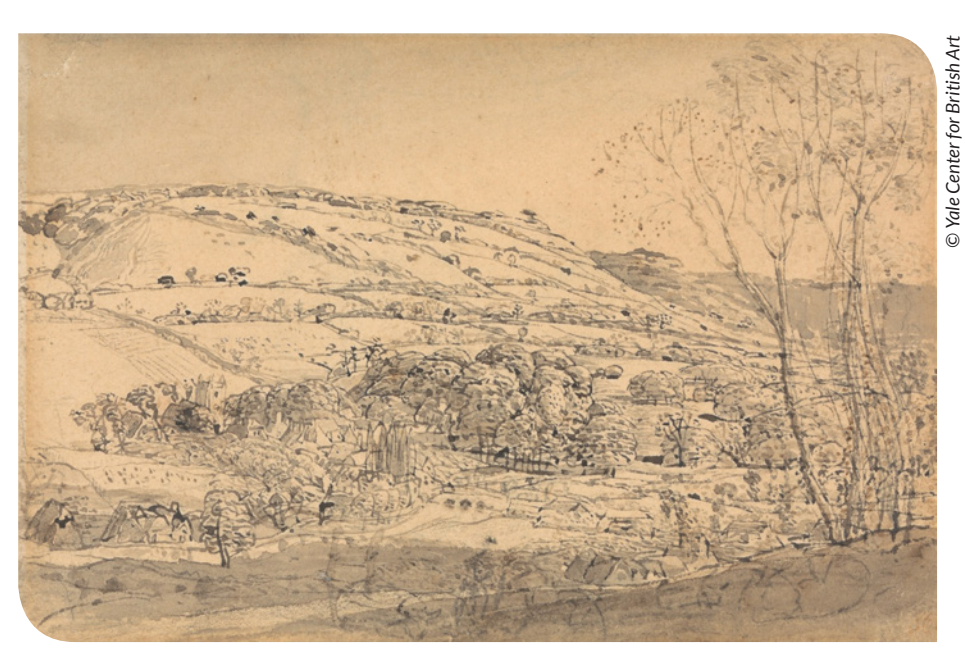
A view of Shoreham in the early nineteenth century by Samuel Palmer

The village expanded significantly after the Second World War, with new developments in Boakes Meadow, Forge Way, Palmers Orchard and Mildmay Place (all excluded from the conservation area) and individual houses on the High Street and on Church Street south-east of the bridge. Most of the shops and businesses have closed during the twentieth century and the buildings converted to residential use, although four of the pubs survive, helped by Shoreham's