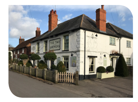
Tall brick chimneys