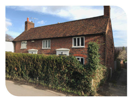
Simple building forms