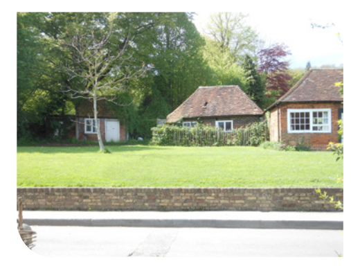
Historic ancillary buildings