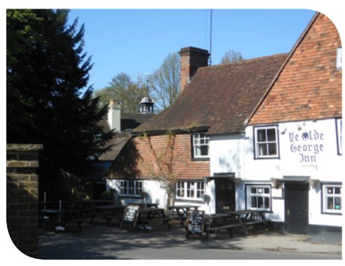
Tile-hanging and clay tile roofs