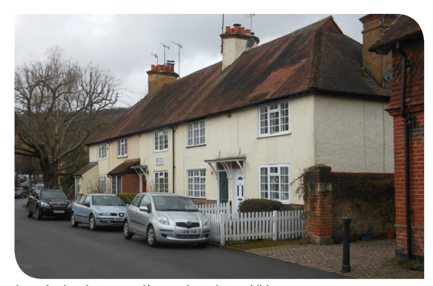
Loss of unity of a terrace of houses due to later additions