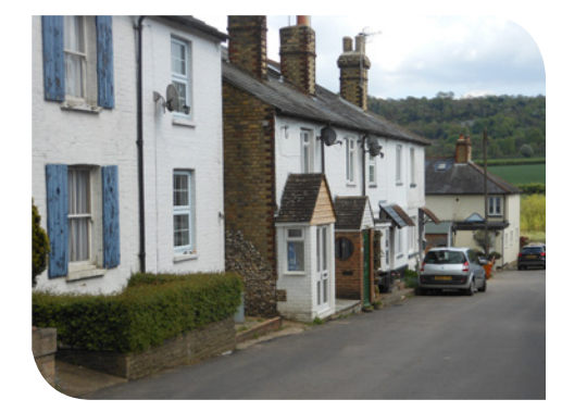
Victorian workers' cottages