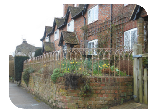
Brick wall and railings